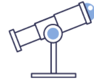
Physics and Astronomy