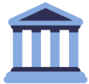
Historical and Pedagogical Sciences