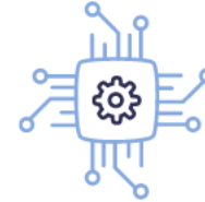
Mathematics and Computer Sciences