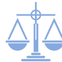
Law, Administration and Economics