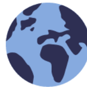
Earth Sciences and Environmental Management